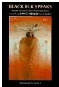
Black Elk Speaks