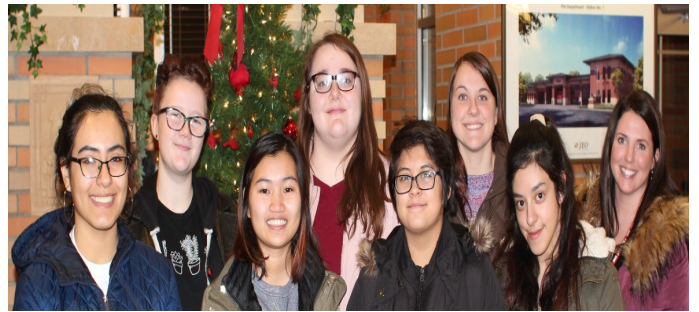
Mock Trial—State Team