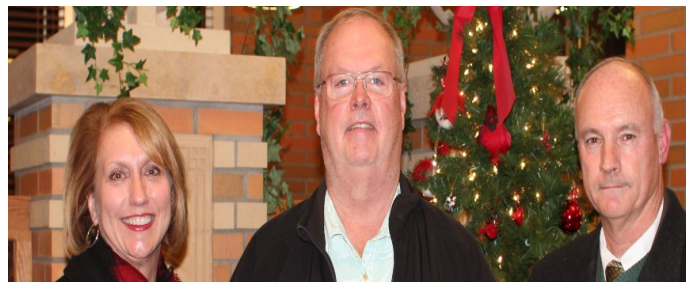
Cardinal Christmas Basket Leadership Team

The State of Nebraska Department of Health and Human services, EMS Division presented an award to South Sioux City Firefighters, Police Officers, Dakota County Sheriff's Department, and Nebraska State Patrol for a life saved.