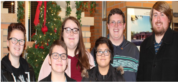
One Act Play District Team