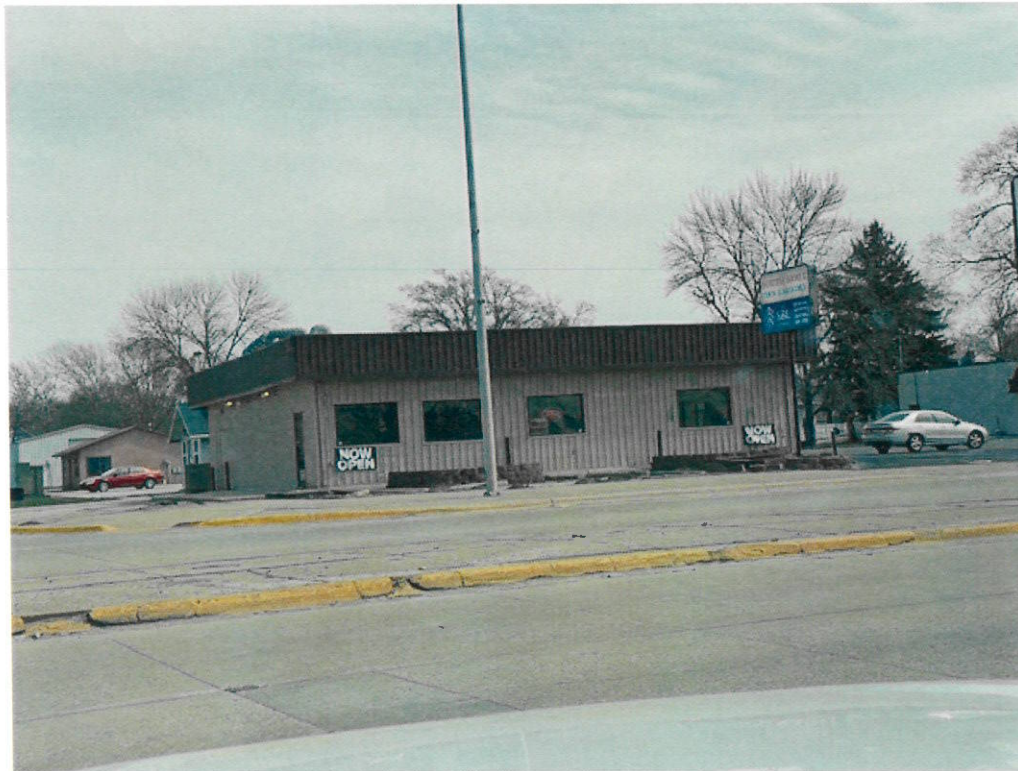
700 Dakota Avenue AFTER