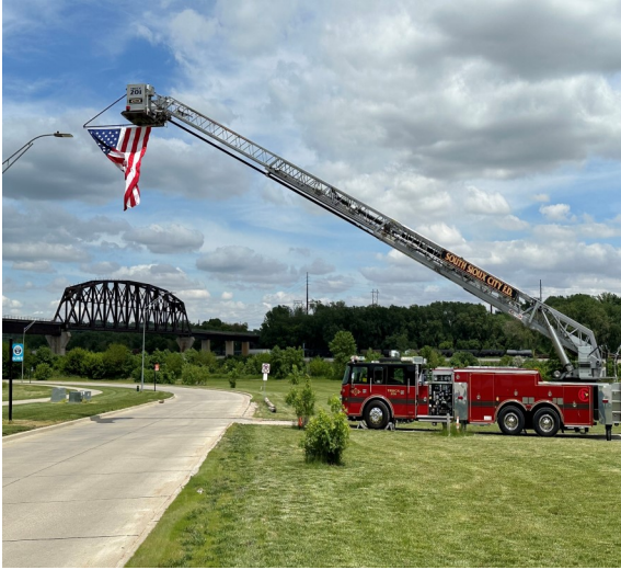
The picture on the top shows the new fire truck setting up the Annual Thunder Ride on Memorial Day into Freedom Park .